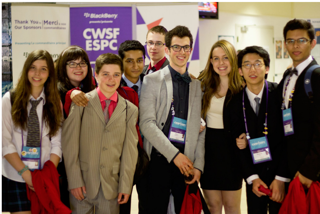
8 members of Team BASEF after judging, plus one extra...

Some serious dark clouds and thundershowers rolled in, but the skies cleared again for the end of judging at t 5:30pm, giving everyone a dry walk back to the residence. There was certainly some relief as judging was finished! From here on, the hard work is done, best efforts have been made, and it's in the hands of the judges.