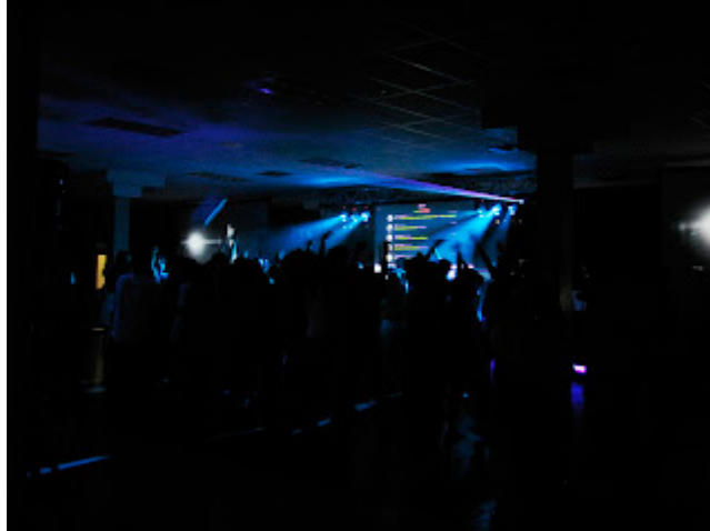
Celebration Dance Event

And with some students leaving tomorrow, including the Australian team that is leaving early in the morning, there were some tears as new friends will once again be separated by distance.