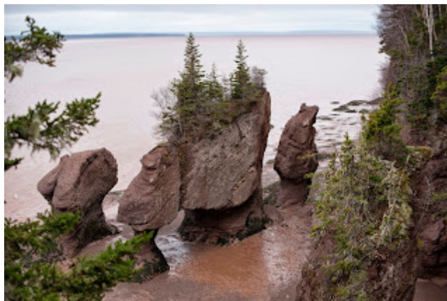
Hopewell Rocks on the Bay of Fundy

There was lots to see and do, and the weather we experienced was as diverse as the tour destinations - a little rain, a bit cold (especially on the coast!), then sunny and warmer.