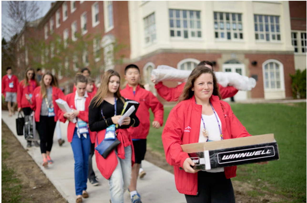
Off to the Project Hall for Setup!

We began the day with an 8am start to head off for breakfast, though there were not any formal events scheduled for most of the day. After breakfast we grabbed our posters and headed out to the Project Hall to set up our posters on the display boards.