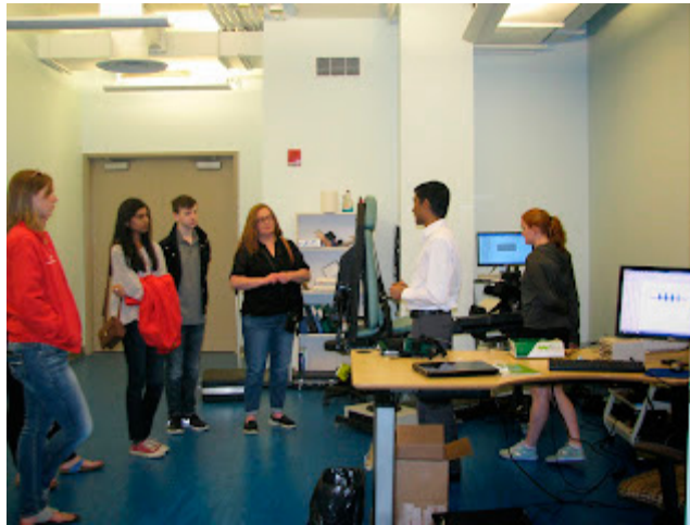
Tour of the Human Performance Lab

Mixed in to that for the finalists was some time to explore the exhibit hall and see other projects, as well as the opportunity to hear some lectures that were taking place.