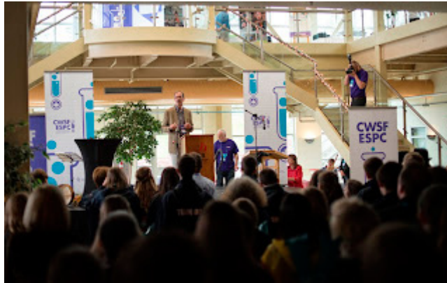
Welcome Event introductions

sample a wide variety of food and activities, and pin trading too. It was a lot of fun for the entire team to just wander the floors checking out what was going on.