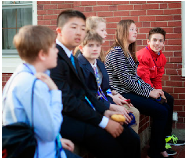
The Team at the end of Public Viewing