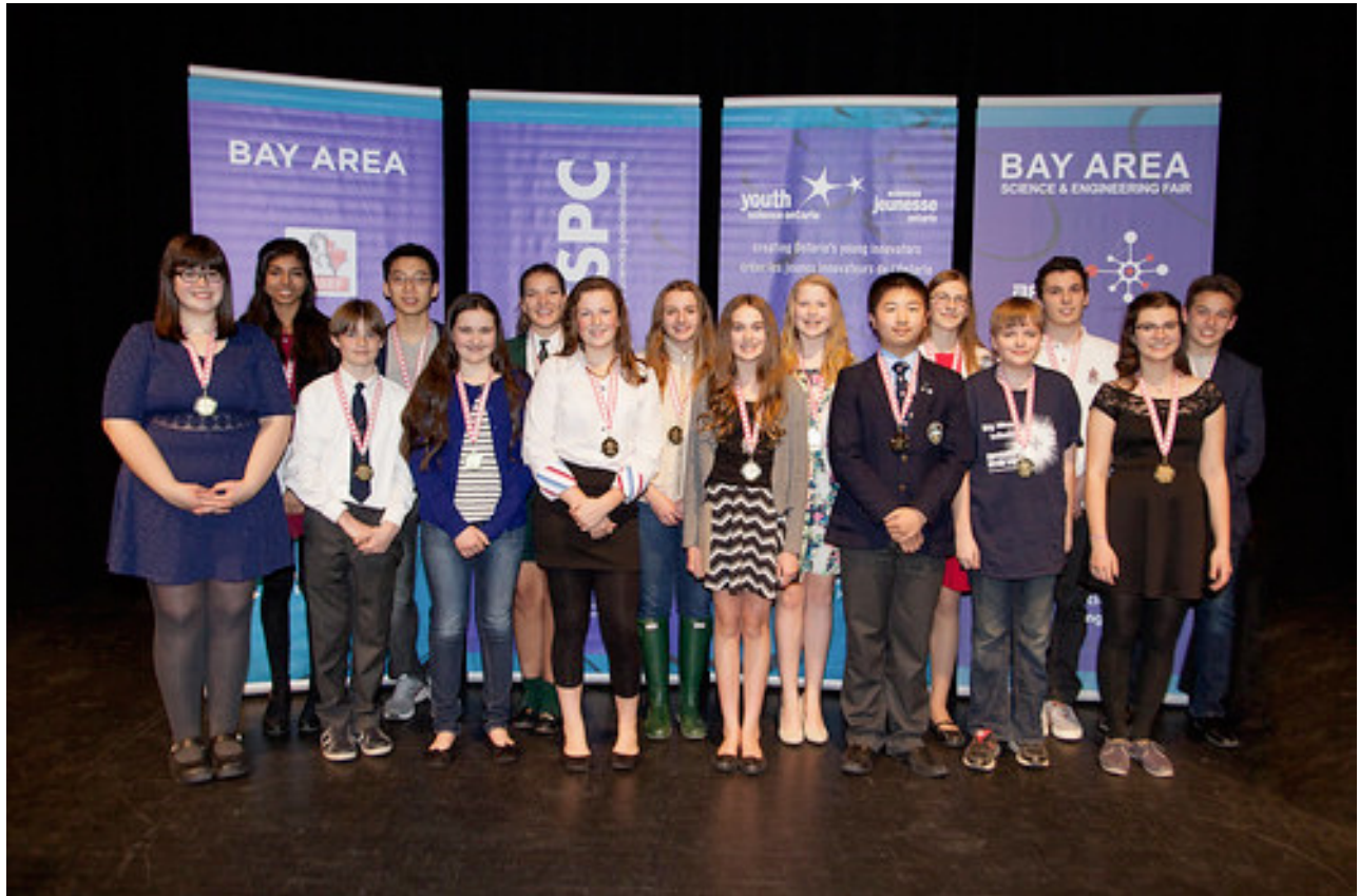
The 2015 Canada-Wide Science Fair Trip Winners

Impressing the judges at BASEF was just the beginning ... since being selected to represent our region at the Canada-Wide Science Fair, this group of 16 students from grades 7 to 12 have been writing the project reports, re-designing their project display backboards, adding to their binders and notes, practicing their presentations.