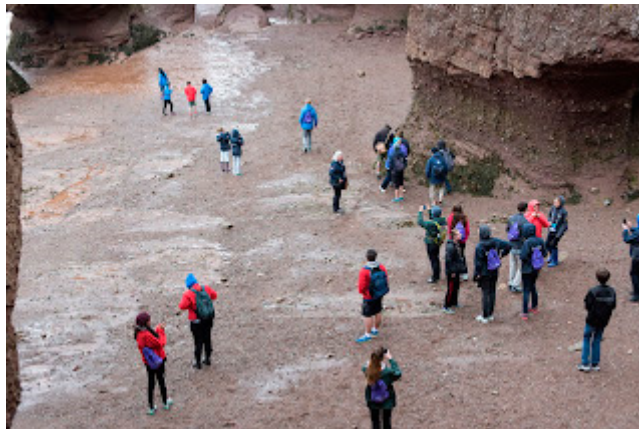
Walking on the ocean floor!