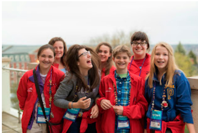
At the Welcome Event

By 9pm everyone was tired, and it was off to bed, to get lots of rest in time for the big day tomorrow... Judging Day!