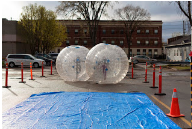
Human Sphere Races