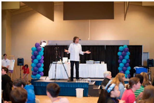
Chef Michael Smith talks Kitchen Science!