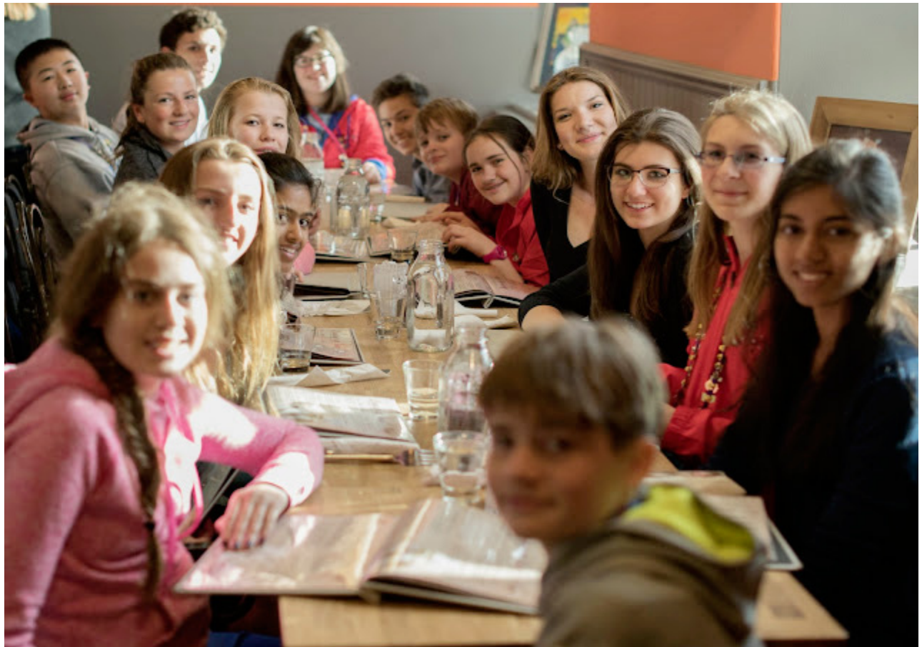
Night on the town Dinner!

The plan was to walk there, and it was a great walk in the sunny early evening. The restaurant was great with a wide variety of dinners to choose from.