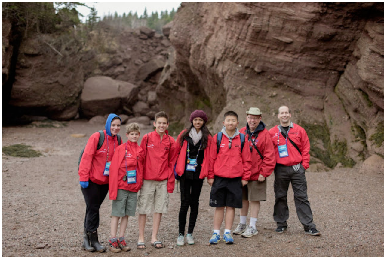
At the Hopewell Rocks on the Bay of Fundy

It was a bit hard to keep track of what everyone was doing today, there were lots of interesting activities that both explored natural features and also gave the students the chance to participate in some activities and demonstrations.