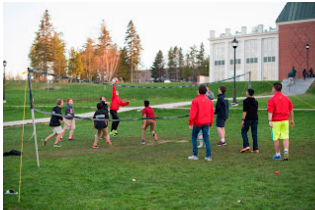
Some free time outside!

Shortly after the public viewing it was the "Camp CWSF" event which included camp-themed food and the CWSF finalist Talent Show. Katie took part in a performance with the Australian team, and all of the performances were great - music and singing, story telling, even a short comedy skit.