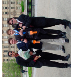
BASEF Team at ISEF and with fellow TEAM Canada members