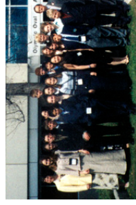
BASEF Team Calgary 2003