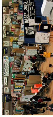
Display Area BASEF 2003