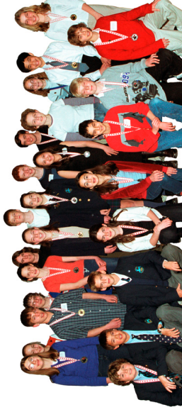
Grand Trip Award Winners BASEF 2003